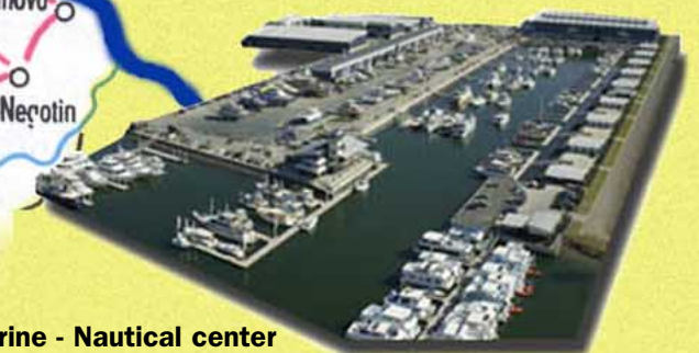
Marine - Nautical center