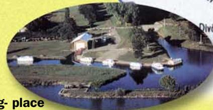
Nautical Landing- place